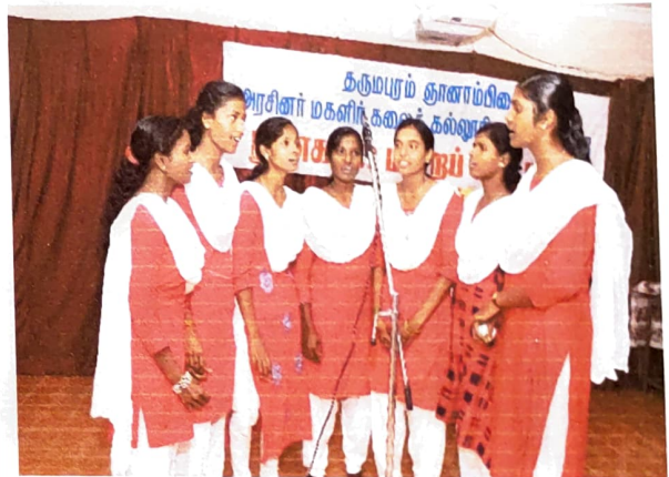
PHOTO 4 GROUP SONGS BY STUDENTS