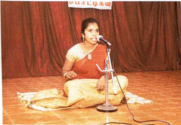
PHOTO 3 CARNATIC SONG BY STUDENT