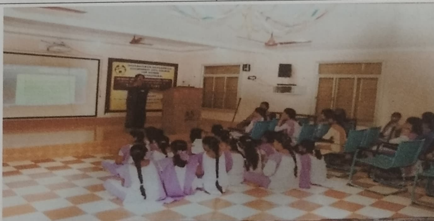
PHOTO 3 SPEECH BY CHIEF GUEST