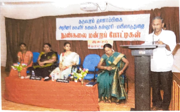
PHOTO 1 PRESIDENCIAL ADDRESS BY THE PRINCIPAL