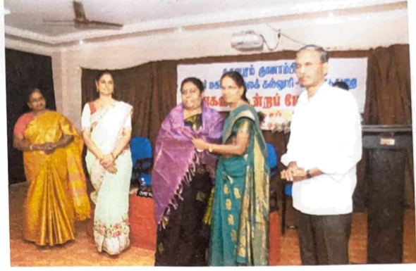
PHOTO 2 HONOUR TO CHIEF GUEST FOR SONG COMPETITON