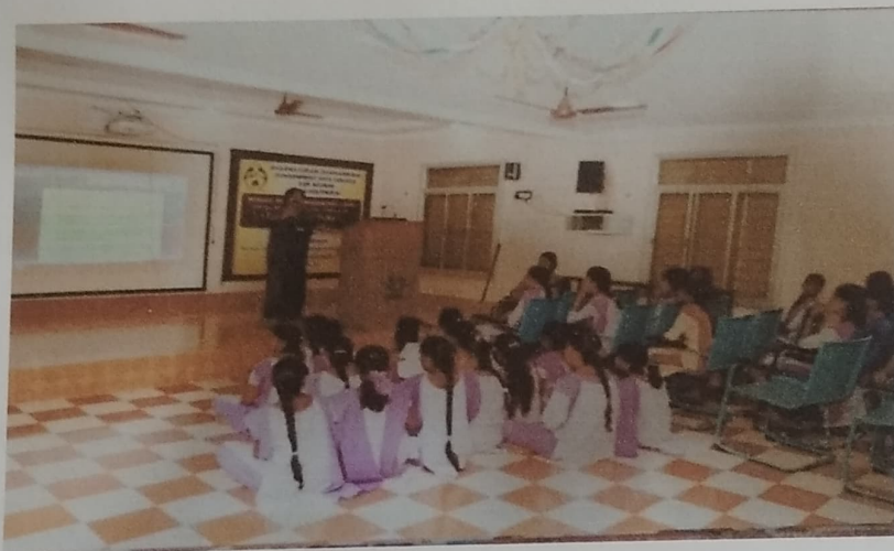
PHOTO 1 ACTIVE PARTICIPATION OF SEMINAR